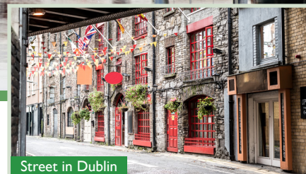
Street in Dublin