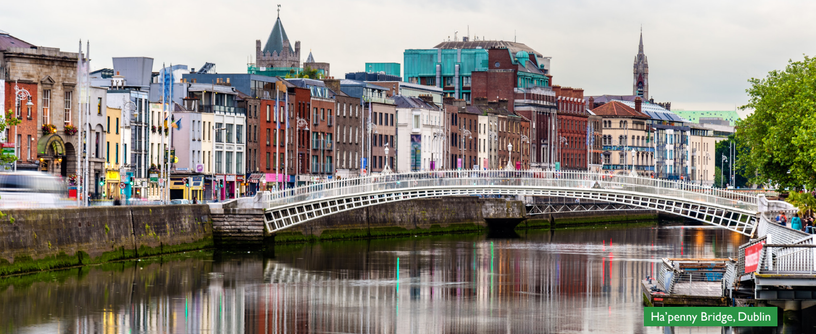
Ha'penny Bridge, Dublin