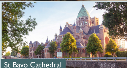
St Bavo Cathedral